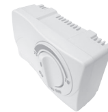
MHX3C Manual Humidistat GFI #7038 Included