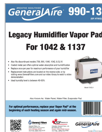
990-13 Vapor Pad® (GFI #7002)