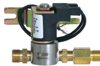
1099-42 Solenoid Valve