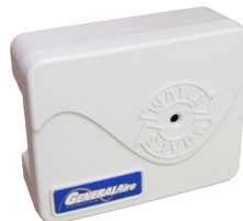
Water Savor Controller Reduce water use by a minimum of 50%!